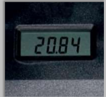
Large 4 digit display for clear readings to 2 decimal places.