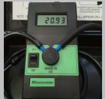
Small, handheld and portable and so can be used in a fabrication workplace or out on site.