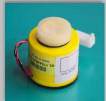
Replacement Sensors and full range of spares available from stock.