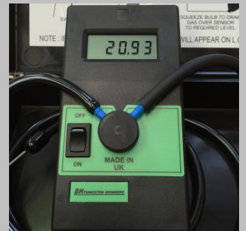
Small, handheld and portable and so can be used in a fabrication workplace or out on site.