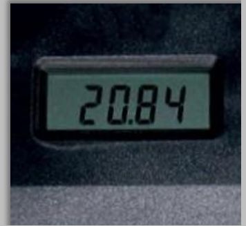
Large 4 digit display for clear readings to 2 decimal places.