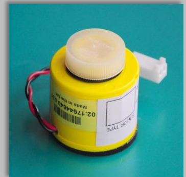
Replacement Sensors and full range of spares available from stock.