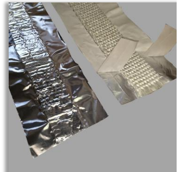
Medium gauge fibre glass cloth backing, 40mm wide for 100mm tape.

This range of Weld backing tape is a simple and cost effective alternative to using a back purging gas. Simply apply a strip of self adhesive tape to the back of the weld to reduce weld oxidation and provide support to the back of the weld.