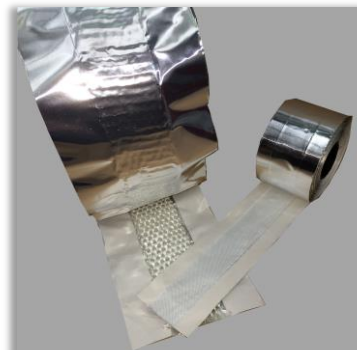
Available in 50mm or 100mm widths on 12.5m rolls