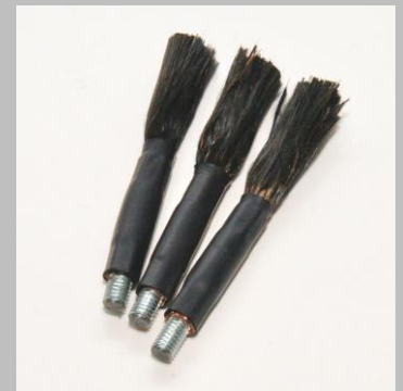
Replaceable brush heads

The Weld Brush is also directly compatible with some other makes of machines.